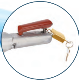
Handle with locking device