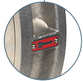
Bidirectional valve with preferred mounting direction for seat durability