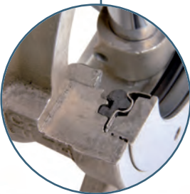
Graphite filled PTFE seat for high temperature application (210°C)