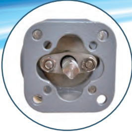
ISO 5211 pad for actuation